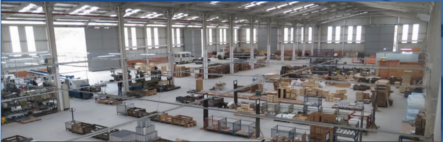
Manufacturing Center GAHO Santa Catarina, Brazil.

GAHO Alignment Pro Tools is a worldwide provider of vehicle suspension repair tools.